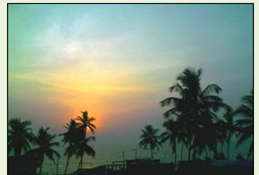
A View from SACAR Terrace