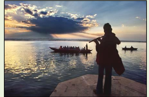
Flute Player, Varanasi